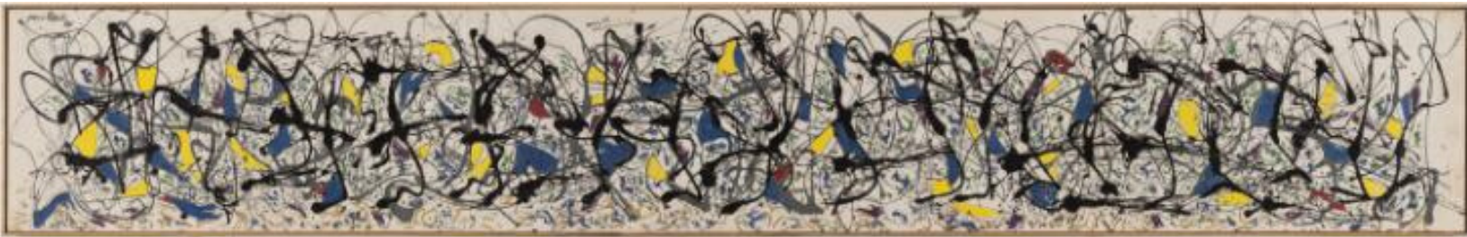
Jackson Pollock Summertime: Number 9A 1948 Tate © Pollock - Krasner Foundation, Inc.

Do this on the grass; no clean up needed!